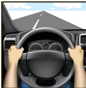
STEER TO SAFETY